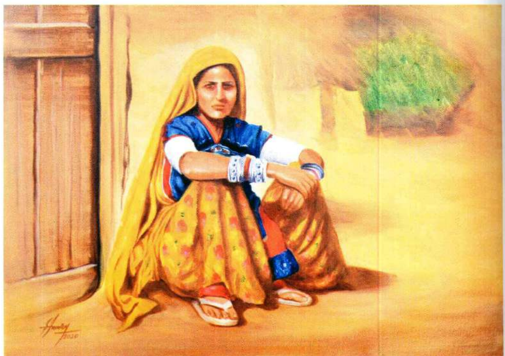
14 x 20

Animals seem to play an important role in his artwork. Majestic elephants,