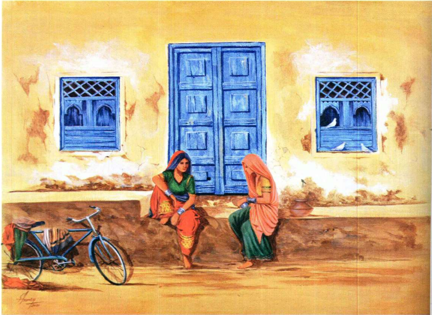
16 x 22

His work is rich in detail and his line work is intricate. The colour palette he uses is calm and soothing. Liberal use of pale blue, beige, white can be seen repeatedly in his work. He does add pops of colour to each of his painting, which highlights the details and draws the viewers in.